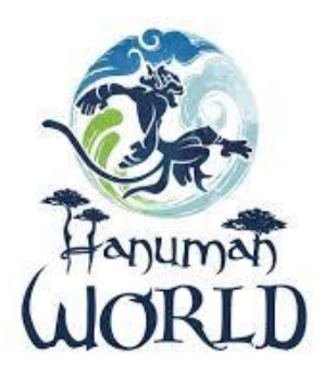
Attractions Hanuman World