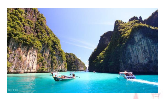
Island Trip Phi Phi Island