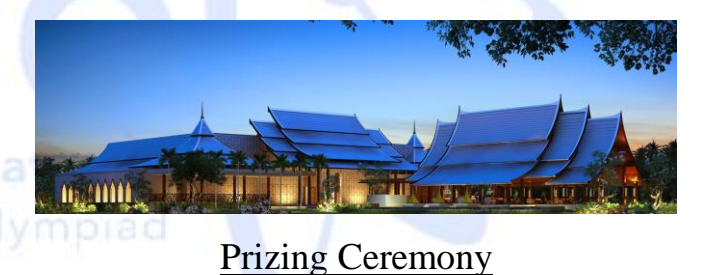
Duangchanok Convention Hall @Duangjitt Resort and Spa, Patong Beach