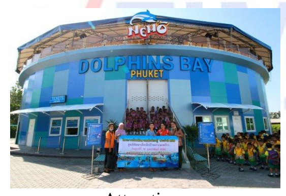
Attractions Nemo Phuket Dolphin Show Follow Us